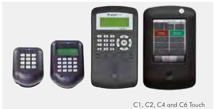
C1, C2, C4 and C6 Touch

To gain access to the cabinet and keys there is a choice of control terminals that all include an integrated smartcard reader which allows most customers to make use of their existing proximity access control cards, PIN or both. There is also an option for biometric verification and a touch screen. The control terminal allows for full flexibility giving the option of having multiple key cabinets controlled from a single point or multiple control terminals controlling the same set of cabinets. This is an important consideration where disability discrimination regulations need to be met.